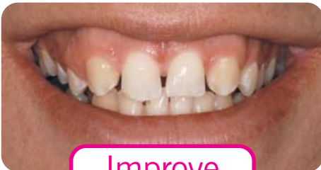
Improve teeth size & gumline