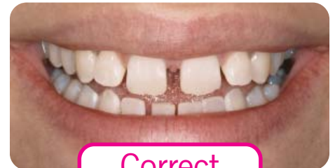
Correct spaces between teeth